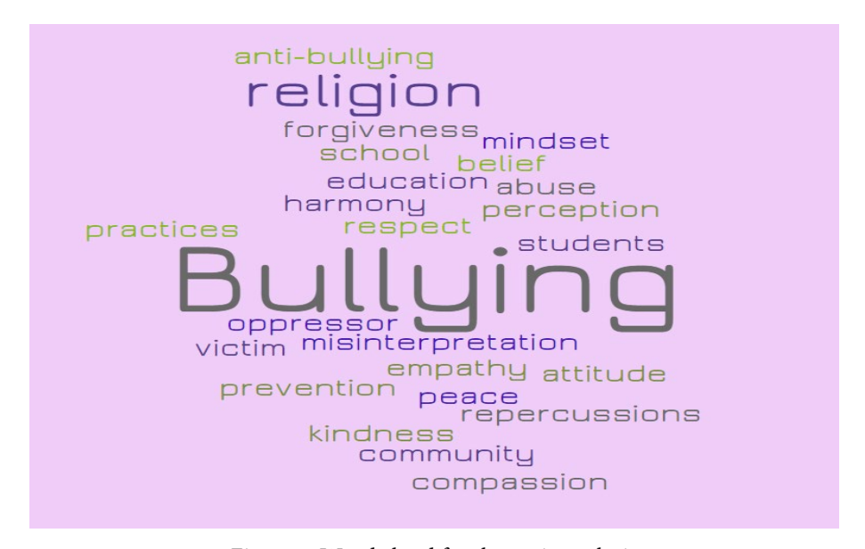
Figure 3: Word cloud for thematic analysis